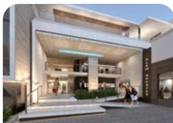
7. PLETT QUARTER HOTEL