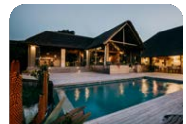
10. BUKELA LODGE