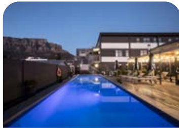
2. KLOOF STREET HOTEL