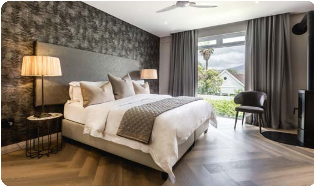
OLD BANK HOTEL KLOOF STREET HOTEL THE THREE BOUTIQUE FRANSCHHOEK BOUTIQUE THE ROBERG BEACH LODGE COTTAGE PIE VILLA PLETT QUARTER SINGA LODGE HLOSI LODGE BUKELA LODGE