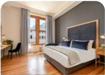
1. OLD BANK HOTEL