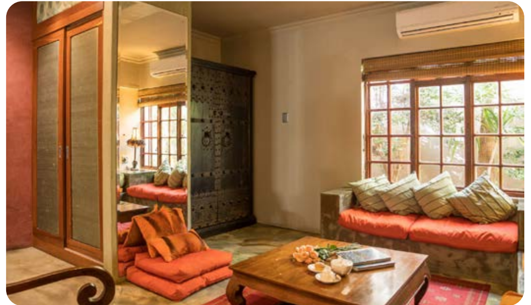
OLD BANK HOTEL