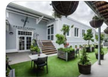
4. FRANSCHHOEK BOUTIQUE