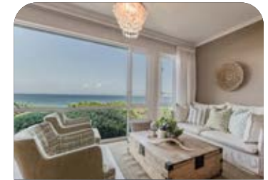
5. THE ROBERG BEACH LODGE