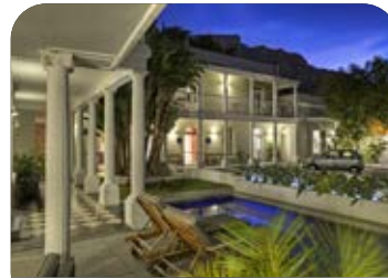
3. THE THREE BOUTIQUE