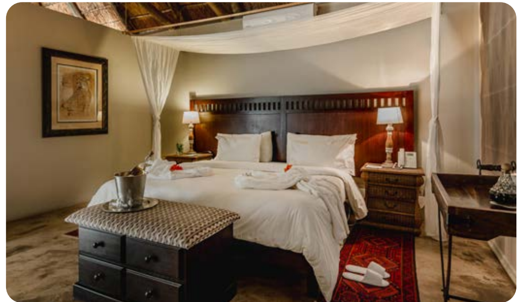
OLD BANK HOTEL