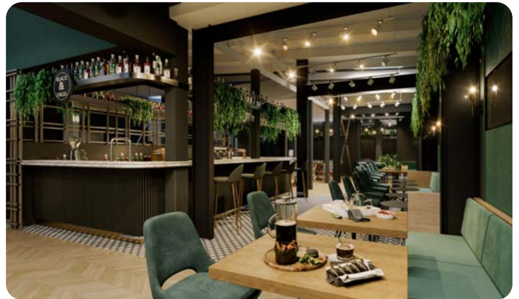
OLD BANK HOTEL