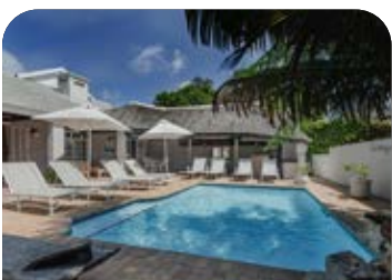
6. COTTAGE PIE VILLA