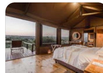
9. HLOSI LODGE